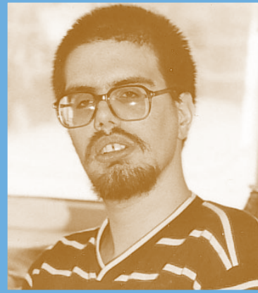
David's artwork is created using only a pencil.