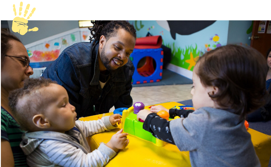
Families of children with developmental delays or disabilities receive coaching, support, and services to help them thrive.